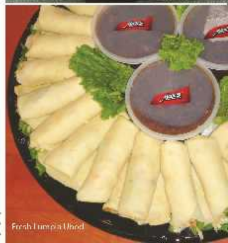
Fresh Lumpia Ubod